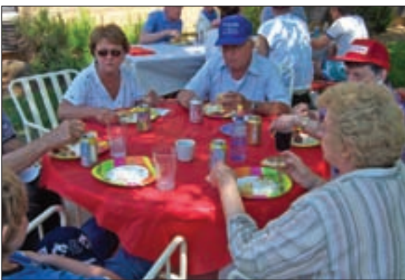
Volunteers and guests sharing the picnic on the patio.

The tables were laddened with salads, relishes, chips and the tasty desserts.