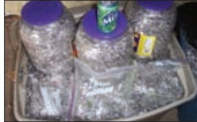
A Tub full of Tabs