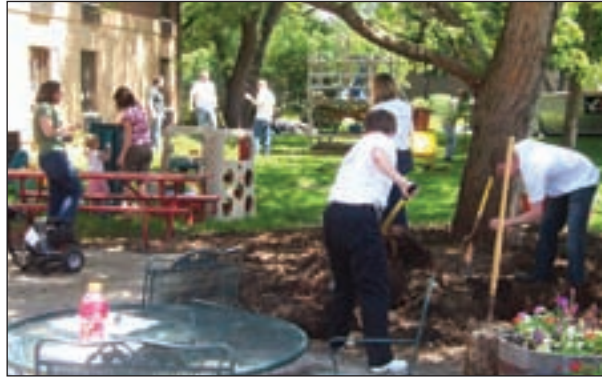
AXA volunteers from the Milwaukee office planted shade-loving plants and renovated the kids climbing area at Kathy's House.