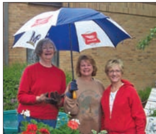
Volunteers from the Dawn E. Petersen Foundation