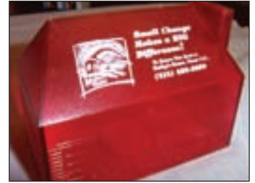
Red Banks: Small Change makes a Big Difference

Upon returning from the recycling center, a letter containing a check for $400 was waiting in the mailbox from our ink cartridge and cell phone recycler. Not a bad day for recycling and helping to keep the environment "green."