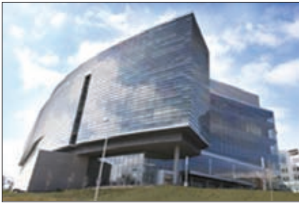
The Froedtert and The Medical College of Wisconsin Cancer Center

The Froedtert & The Medical College of Wisconsin Cancer Center is the fastest growing cancer treatment facility in southeastern Wisconsin, based on 2001-2005 market data for outpatient cancer surgery, radiation oncology and hematology/oncology services. To meet the growing demand for cancer care, a new and expanded Froedtert & The Medical College of Wisconsin Clinical Cancer Center opened in May 2008.