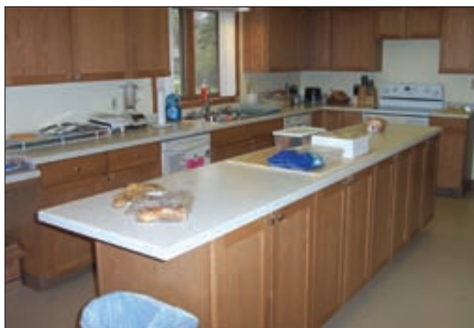
Kathy's House Rainbow Kitchen

You are all invited to stop for a tour of the new Rainbow Kitchen.