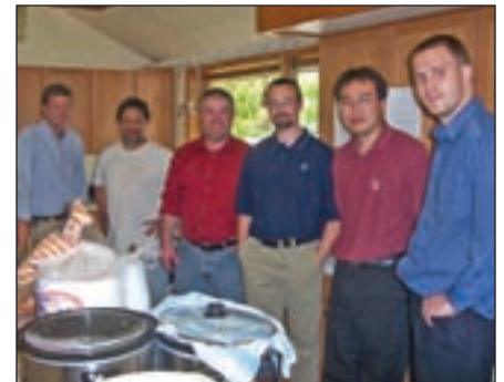
A team of chefs from GE HealthCare Technologies prepared a wonderful meal for Kathy's House

If you have a desire to help, please contact Kathy's house at 414-453-8290 to obtain details about our volunteer program. We try to customize each opportunity to fit your goals and objectives and our needs. Call today!