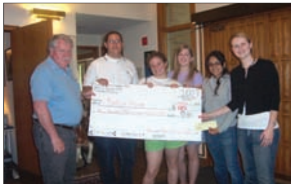
The BIG check presented to Kathy’s House.

The Honor Society of the Milwaukee School of Languages performed a Random Act of Kindness at Kathy’s House. Unannounced, some of the members presented Kathy’s House with a check from Honor Society fund raising activities. This is not the first R. A. of K. from this group. Last winter, they helped decorate Kathy’s House for the Holiday season.