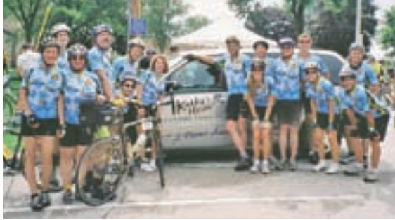
Riders at the Port Washington rest stop.

As in past years, a large portion of the contributions were generated by mothers, fathers, sisters, brothers, sons, daughters and friends, riding on July 24 and 25 in memory of a loved one who died of a blood-borne cancer or someone who has survived leukemia or lymphoma.