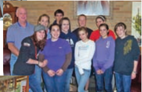
Youth group from Spring Creek Church