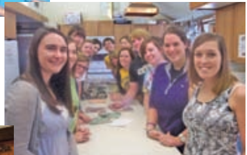
Circle K Group from Marquette University