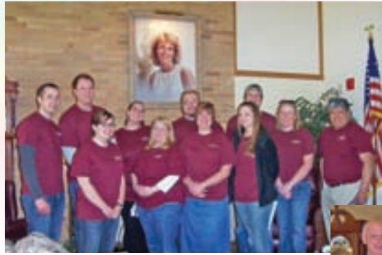
Community Involvement class from Cardinal Stritch