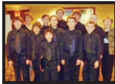
Bel Canto Boy Choir