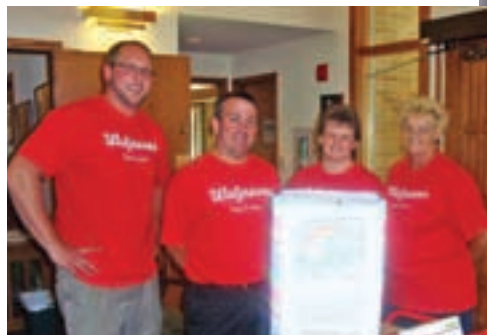
Local Walgreen Stores contributed wish list supplies and prepared a dinner for guests

We continue to be extremely gratified by the number of groups that offer their volunteer time and services to help us continue the mission of Kathy's House. Activities include outside yard work, baking, cooking and cleaning.